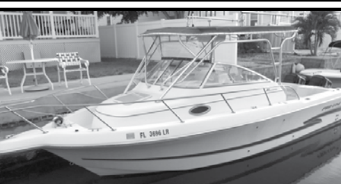
2001 Proline 26 Express $31000