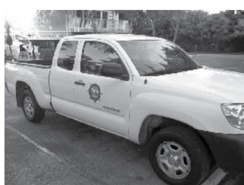
2008 Toyota Tacoma pickup with automatic, A/C, bumper hitch. $10,500