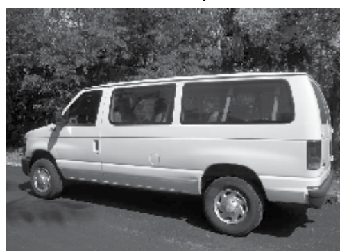
2009 Ford E-350 12-passenger Wagon with front A/C, towing package. $10,000

Contact Keith Douglass, Facilities Director, Boy Scout Sea Base 305-664-5613