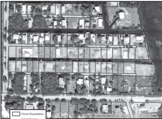
Canal 266 Big Pine Key, FL

The public hearing is being held for the purpose of receiving public comment on the proposed assessments and collection of the assessment on the ad valorem tax bills. All affected property owners have the right to appear and provide input at the hearing, and may file written objections with the County Administrator at any time prior to the public meeting or within twenty (20) days following publication of this notice, whichever is greater.