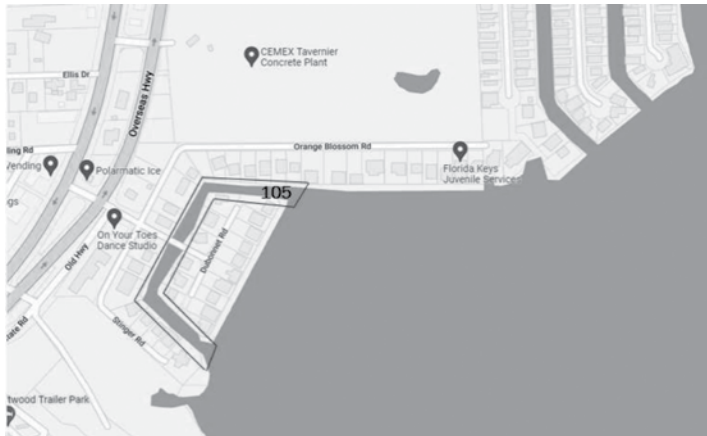
Canal 105 Tavernier, FL

A geographic depiction of the properties subject to the assessment is below: